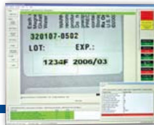
Vision Studio Inspection Wizard Graphical User Interface