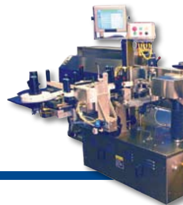
Retrofitted Vision System for High-Speed

Pharmaceutical Medical Device Consumer Products