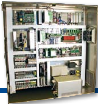
Electrical Controls Enclosure

Zynergy Solutions is a turnkey provider of integrated machine vision and motion solutions for high-speed, automated assembly applications. Zynergy has over 100-man years of experience integrating machine vision and motion solutions into Pharmaceutical, Consumer Products, Medical Device and general manufacturing applications. We have extensive experience working with end users, OEMs and machine builders. Since 1999 Zynergy Solutions has deployed hundreds of systems throughout the world that our customers count on daily to provide accurate, reliable and timely inspection and identification results.