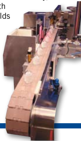
Label Placement/Label Skew Inspection

No one takes more pride in building and installing integrated inspection systems and achieving a higher ROI for its customers than Zynergy Solutions. Our mission and our passion are to ensure our customers' long-term quality and productivity through the use of automated inspection solutions. We help customers achieve these goals through our unique combination of the right people, products, partners and processes. Zynergy hires only the best people with advanced technical expertise, provides next-generation technology, promises error-free precision and on-time delivery, and teams up with leaders in the fields of automation and controls to ensure our customers' success.