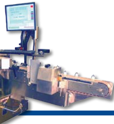
Inspection and Controls Speed Labeling Machine

Zynergy's complete project management and documentation capabilities mean we can assume turnkey responsibility for your inspection project. Zynergy has the horsepower, experience and expertise to manage your inspection project from conceptual design to production startup.