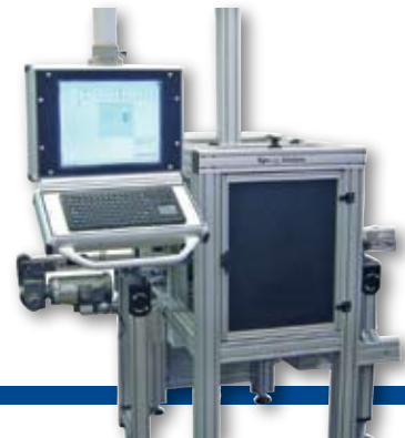
Zynergy SM Vision Studio Inspection Wizard TM